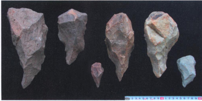
Fig. 5. Picks with notched tips throughout the Konso early Acheulean sequence. From left to right, KGA6-A1 (~1.75 Ma), KGA4-A2 (~1.6 Ma), KGA12-A1 (small and large; ~1.25 Ma), and KGA7-A3 (large and small; ~1.4 Ma).

Konso evidence now indicates that the earliest known crude Acheulean technology was somewhat widespread by at least ~1.75 Ma. Thus, it now seems that the emergence of the large flake-based Acheulean technology must have broadly coincided with, or closely preceded, the emergence of a H. erectus -like morphology within the early Homo lineage.