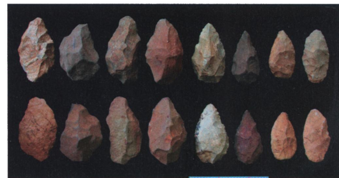
Fig. 4. Handaxe refinement through time. Upper, dorsal; Lower, ventral. From left to right, two each are shown from KGA6-A1 (~1.75 Ma), KGA4-A2 (~1.6 Ma), KGA12-A1 (~1.25 Ma), and KGA20 (~0.85 Ma). In each pair of handaxes from the respective sites, near-unifacial (left) and more extensively bifacial (right) examples are shown (except with the KGA20 handaxes, which are both well worked bifacially).

Konso Acheulean from ~1.6 to <1.0 Ma. The earliest typical early Acheulean assemblage at Konso is represented by the ~1.6-Ma KGA4-A2 assemblage. This assemblage and the later Konso occurrences seem broadly comparable in workmanship with the early Acheulean of Olduvai Bed II (2), best known at sites EF-HR (~1.5–1.6 Ma) and BK (~1.3–1.4 Ma). The KGA4-A2