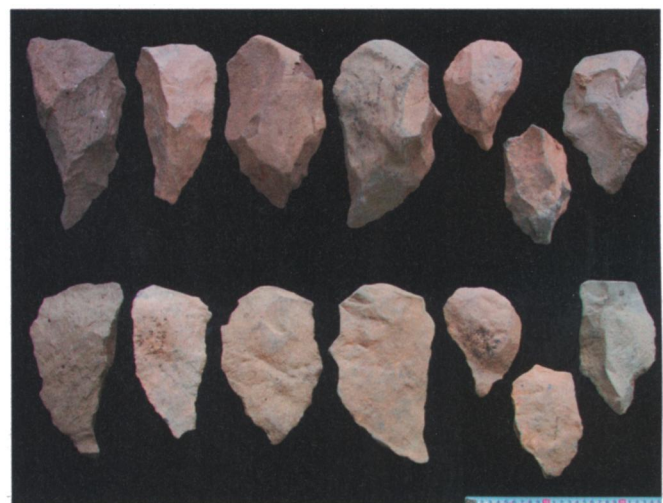
Fig. 2. The ~1.75-Ma KGA6-A1 picks made on large flake blanks. Upper and Lower show dorsal and ventral views, respectively. The largest pick (fourth from left) is 229 mm long with a trihedral section 90 mm thick.

somewhat older than but compatible with the interpolated Okote Tuff age of 1.56 \pm 0.05 Ma (30). Our ^{40}\text{Ar}/^{39}\text{Ar} ages of 1.66 \pm 0.06 and 1.66 \pm 0.02 Ma (Table S2) of the NBT are older than the recently suggested Morutot Tuff age of 1.61 \pm 0.02 Ma (30) but not significantly different from the Morutot's plateau age of