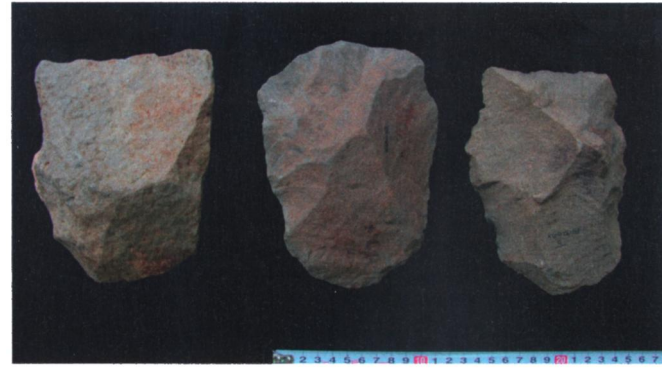
Fig. 3. Cleavers from KGA6-A1 (~1.75 Ma; Left), KGA4-A2 (~1.6 Ma; Center), and KGA12-A1 (~1.25 Ma; Right).

KGA6-A1 Locus C Acheulean. The KGA6-A1 site was first recognized by surface artifacts that included crude unifacial picks made on large and thick flake blanks. Subsequent excavations were conducted, and in situ Acheulean tools were recovered on top of a silty sand layer capped by waxy clay. Together with the surface scatter immediately adjacent to the KGA6-A1 Locus C excavation area, we recovered a total of 47 large flakes, some bifacially or unifacially modified. Of these flakes, 18 are sufficiently shaped to be classified as picks, handaxes, or cleavers (Figs. 2, 3 and 4). The raw materials used were almost exclusively the locally available basalt. The larger tools exceed 20 cm in maximum dimension. Most are shaped entirely by unifacial modification. Although flake scar counts tend to be low (often <10), the dorsal face is flaked, with no cortex remaining in approximately one-half of the tool items. Picks are dominant and mostly made on thick flake blanks. Asymmetric converging sides